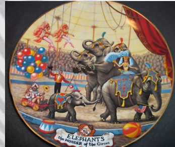
Language & culture