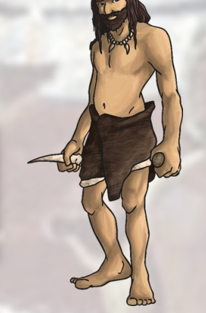
Hunters & gatherers