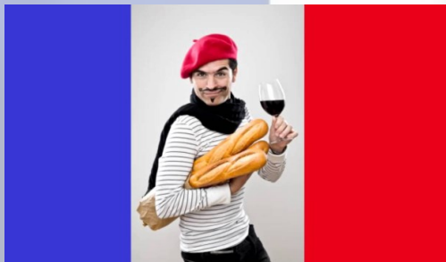
Language & culture